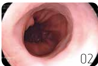
After therapy the mucosa is completely restored