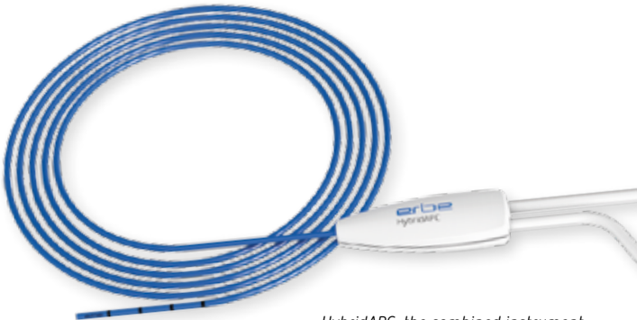
HybridAPC, the combined instrument for Barrett's elevation and ablation