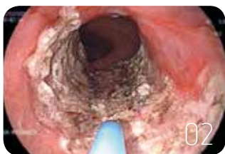
An ablation zone forms after the APC application